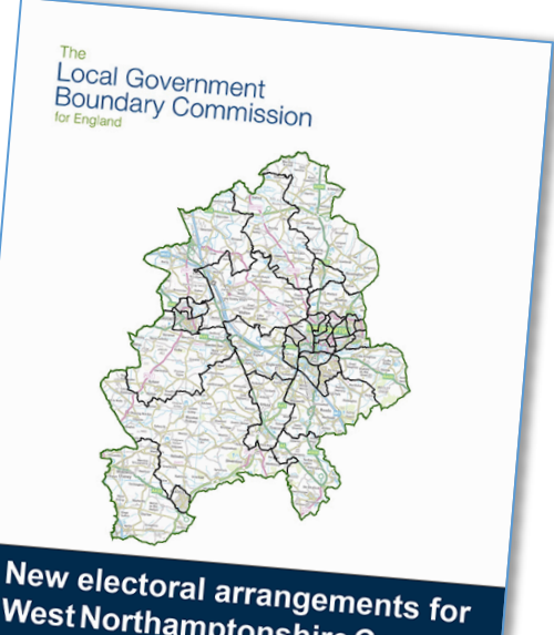
West Northamptonshire Council Final Recommendations

We welcome the publication of the Boundary Commission's final recommendations in the first review of electoral arrangements across our area for a decade. Their conclusions strike a fair balance in making sure the number of councillors and electoral ward patterns reflect the democratic needs of our residents and support our council more effectively in representing communities, delivering council business and providing efficient governance.